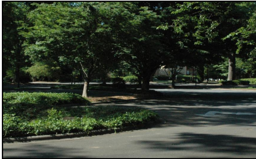
Figure 12.11-2: Example of parking lot broken up by landscaping.